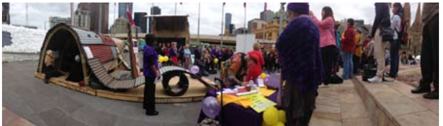
World Laughing Day 5 May