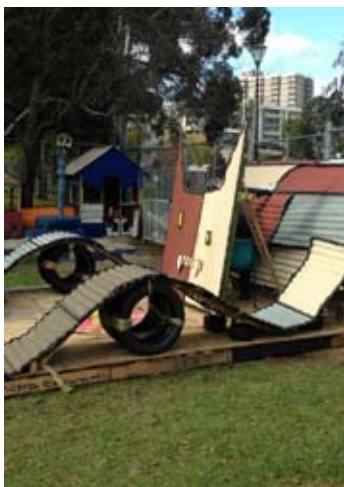
MeowHaus at The Venny