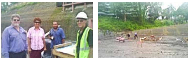
On site Pacific Eye Institute

VDD has been appointed as access consultants for the project and are working with the architect and FHF to deliver an exemplary, easy to navigate facility free from mobility barriers.