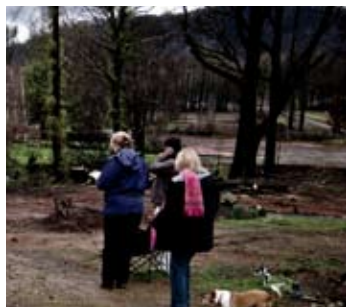
On site at Marysville

Visionary Design Development Pty Ltd continue to be involved in Victoria's Bushfire Reconstruction efforts, on behalf of Archicentre and independently. VDD has prepared designs for projects located in Pheasant Creek, Flowerdale, Kinglake and Marysville. Sustainability, accessibility and affordability are recurrent design themes.